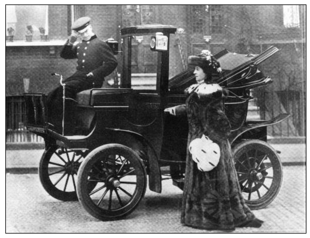
Figure 1: Electric vehicle used as a taxi in New York City in 1901

Larminie and Lowry (2003, p. 3) state that, despite their advantages over competitors with steam engines or internal combustion engine at that time, electric vehicles started losing ground as from 1910 due to low autonomy of batteries, the fall in fossil fuel prices and the internal combustion engines development. They also mention that, ironically, batteries and electric motors have become the set of components for the drive starting of the internal combustion engines – presently known as engine starters.