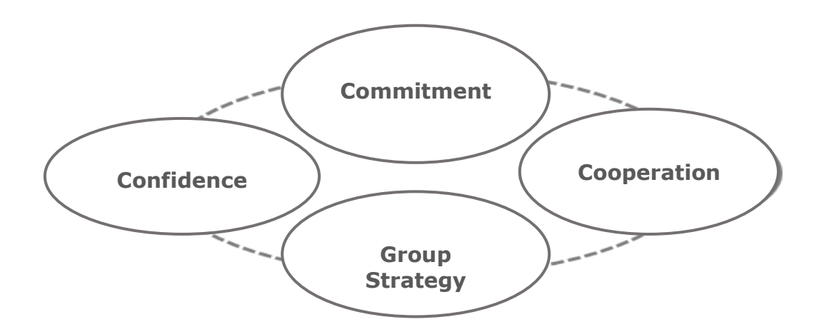
Figure 1: Social Aspects related to network competitiveness.

Besides the group strategy to compete as network, this research focuses only social aspects – confidence (trust), commitment and cooperation, likely to exist in an inter-organizational network, as shown in Figure 1. The purpose is to understand how these associated social aspects affect the network competitiveness.